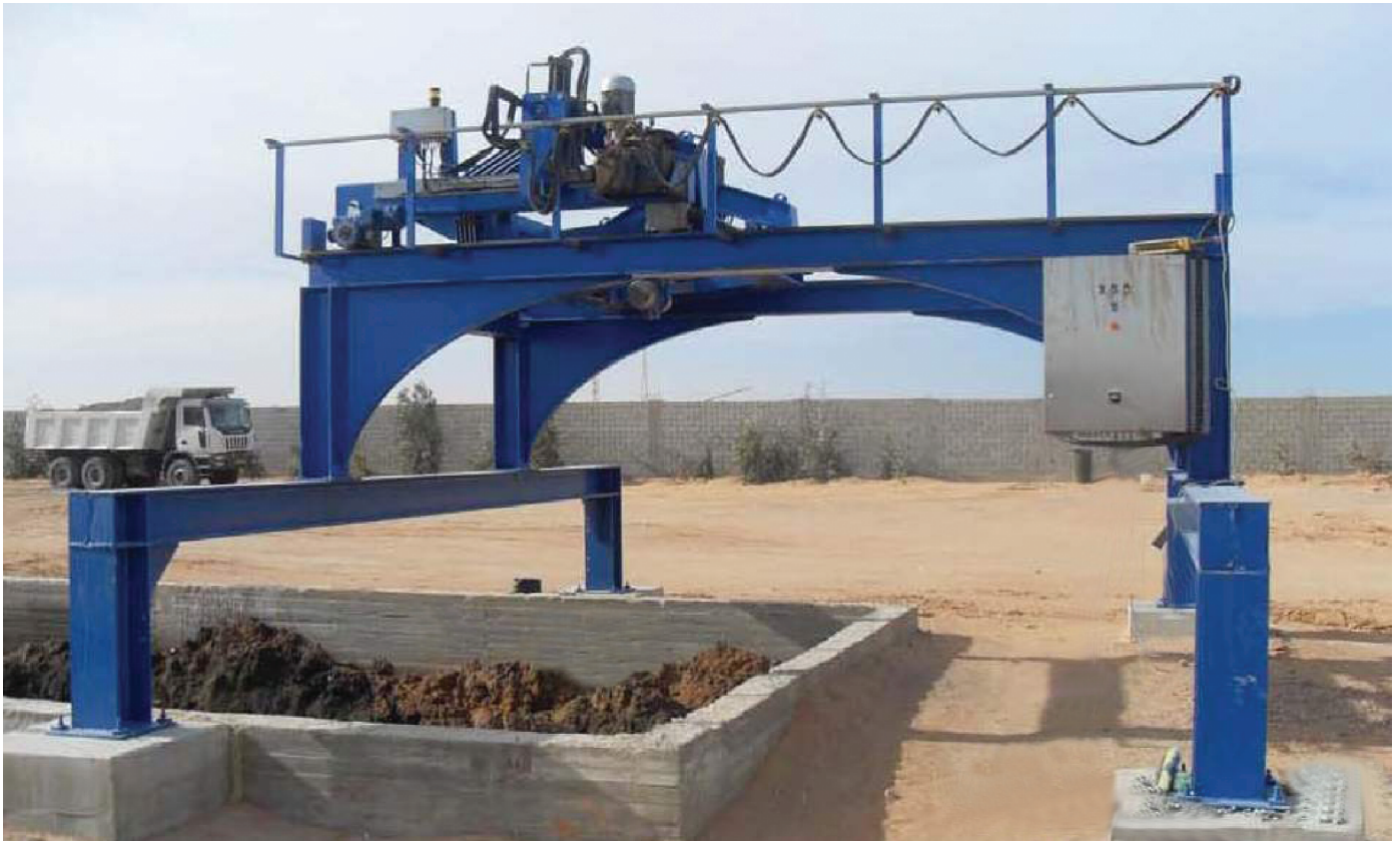
Skips Turner installed on top of "in ground" pit