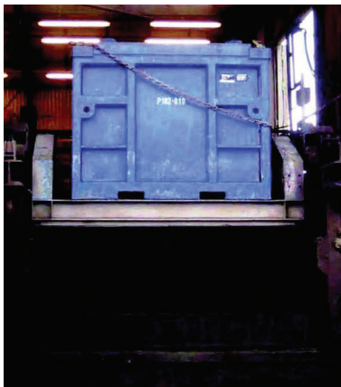
Cuttings Skip positioned on turntable