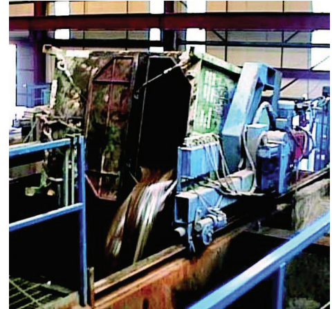
Cuttings Skips Turner