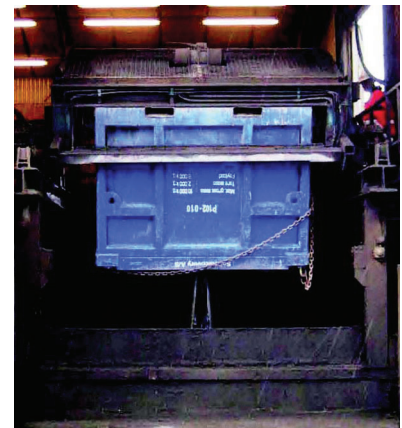
Shaking motion ensures full discharge of cuttings from skip