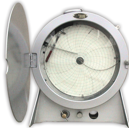
M252A Series Recorder for single input applications.