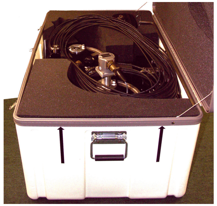
A padded storage box is provided for DMS transport and storage.