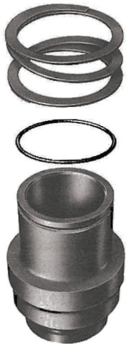
Type D Packer Assembly