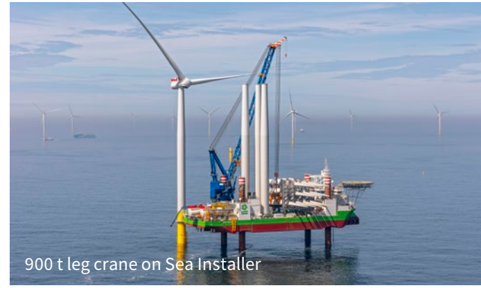
900 t leg crane on Sea Installer