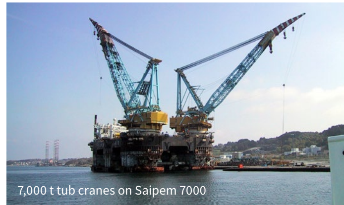
7,000 t tub cranes on Saipem 7000