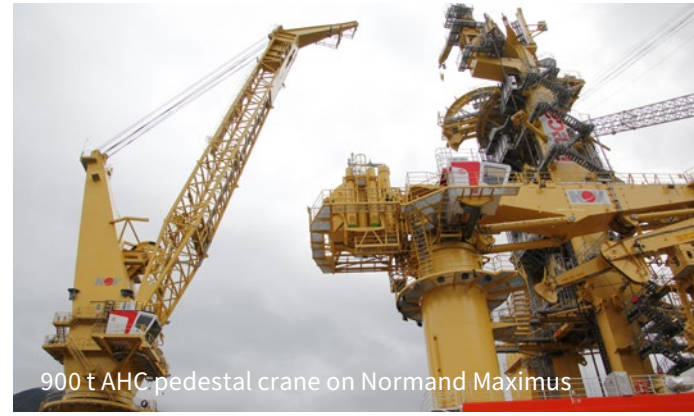
900 t AHC pedestal crane on Normand Maximus