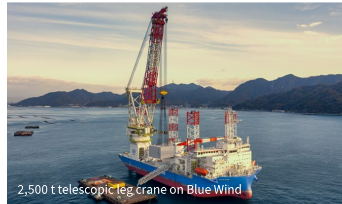
2,500 t telescopic leg crane on Blue Wind