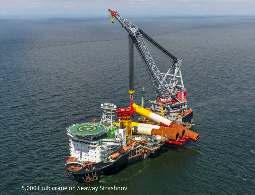
5,000 t tub crane on Seaway Strashnov