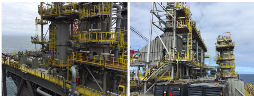
Figure 2. Almost 2.6 miles of the MARRS® OFFSHORE handrail system was installed throughout the entire Clair Ridge facility. The handrail system meets strict NORSOK safety requirements and is dramatically more corrosion resistant than steel.