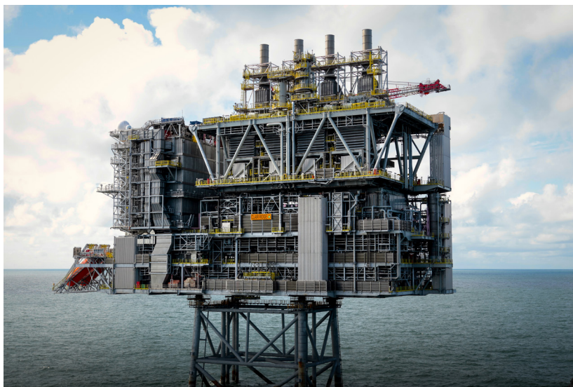
Figure 1. The Clair Ridge platform, a state-of-the-art facility where BP will begin recovery of 640 million bbls of oil and deploy their LoSal® EOR technology for the first time.

When NOV's work on the Clair Ridge project began, BP's primary objectives were simple: reduce the platform's weight and its susceptibility to corrosion through the installation of fibreglass pipe. An engineer from Pipex px®, part of NOV's Fiber Glass Systems business unit, was sent to work in BP's London-based