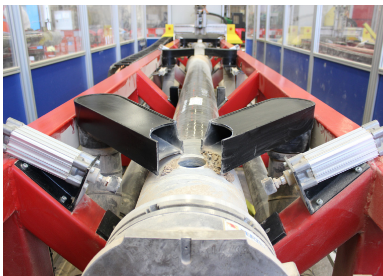
Figure 5. One of two custom CNC machines built to manufacture the pressure vessels to BP's specification parameters while maintaining repeatable quality and production flow.