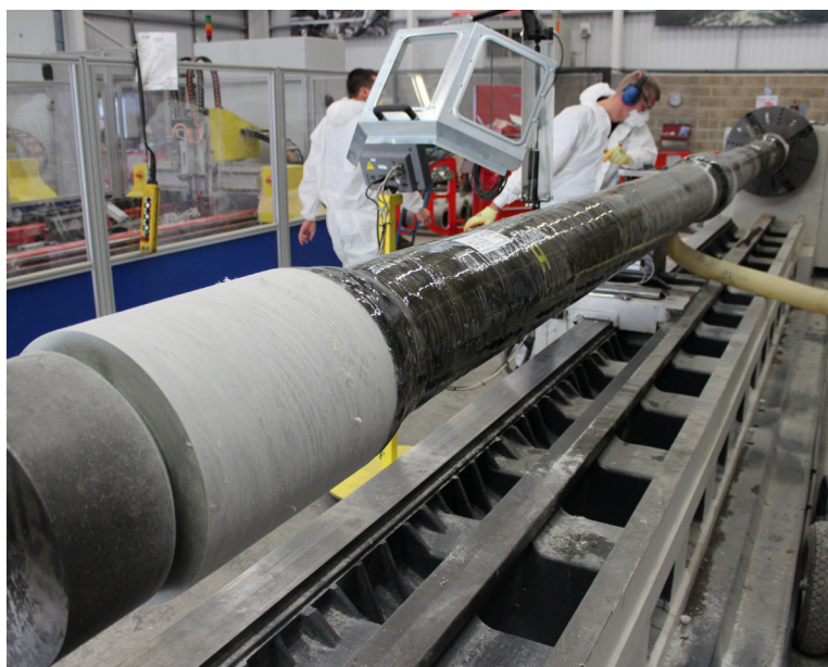
Figure 4. GRE pressure vessels during skinning of outside diameter to allow for the pipe to be positioned within the CNC machine for precision drilling of holes and internal recesses. Production ran for 24 hours a day, 7 days a week to meet strict project deadlines.

Sometimes, the most difficult issues that the oil and gas industry faces can be addressed through a combination of engineering ingenuity and dedicated technical expertise. The size of offshore structures has necessitated that more attention be paid to weight control, with the issue being of such importance that engineering and construction is now governed by stricter design philosophies and standards. Corrosion on structures of such size and complexity is a similarly problematic issue, particularly as operators seek to drill in more challenging, unexplored frontiers and eliminate the threat of assets having to be prematurely replaced. This project brought together fibreglass product solutions, comprehensive engineering services, and technical authority to deliver major results, thus reinforcing the belief that sometimes, one has to break tradition to achieve success. ■