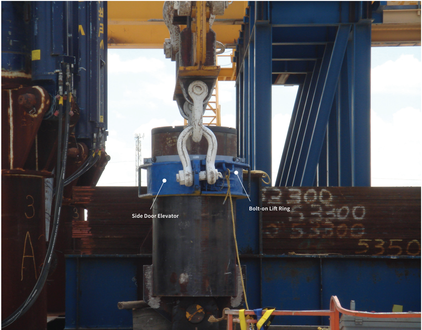
Figure 1: Load Test to 150 Tons

Testing was completed at Versabar, Inc. in Houston, Texas using tension test machines oriented both vertically and horizontally. Each test procedure utilized a 36-inch side door elevator to transfer the load from the hydraulic cylinders to the lift ring. The applied load was incrementally increased and was held at the desired load for ten minutes before releasing. Load cells monitored and recorded the tension applied to the lift ring for each test.