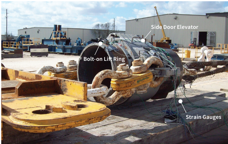
Figure 2: Load Test to 250 Tons

The Viper bolt-on lift ring is rated to 150 short tons and has been successfully tested to 250 short tons.