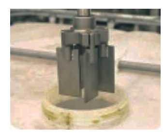
E-400 Folding Impeller closed