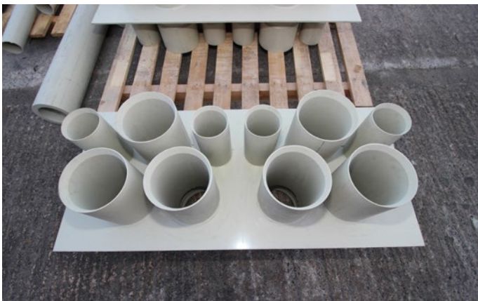
Variable diameter puddle flange