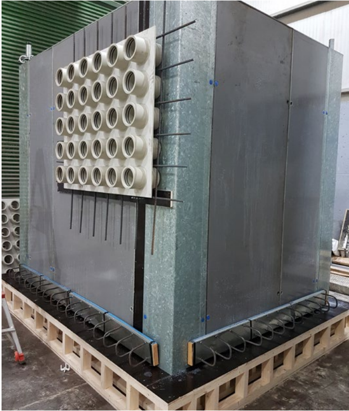
Pipex Puddle Flange used within precast concrete cable draw pits