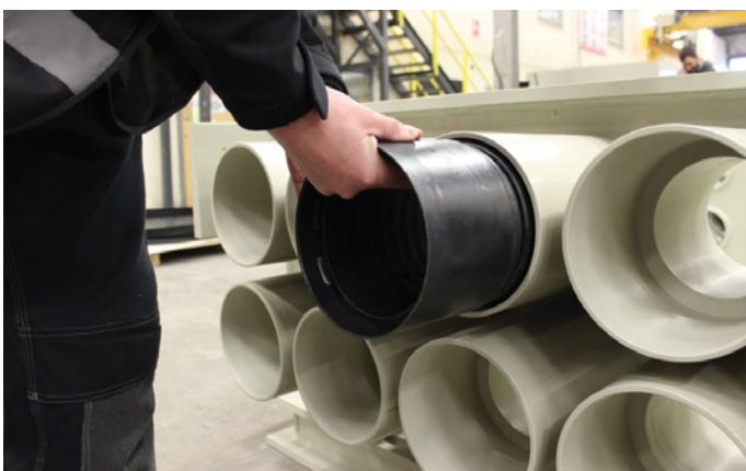
Sockets as required to suit cable duct system or service pipe entry