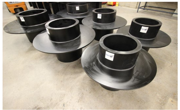
Large diameter individual puddle flanges