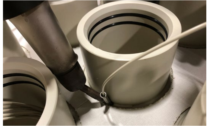
Welded service ducts entries with 'o' ring seals