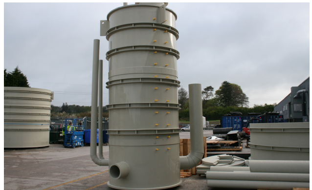
Connections as required