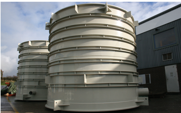
Circular holding tank