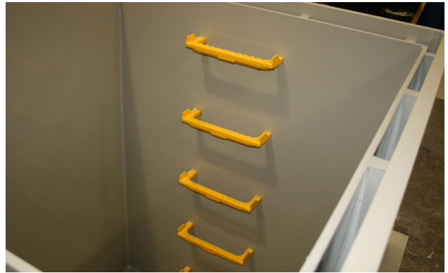
Optional access step irons