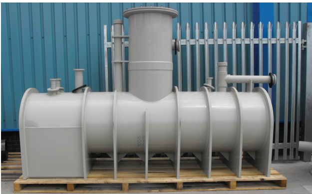
Radioactive dual contained tank