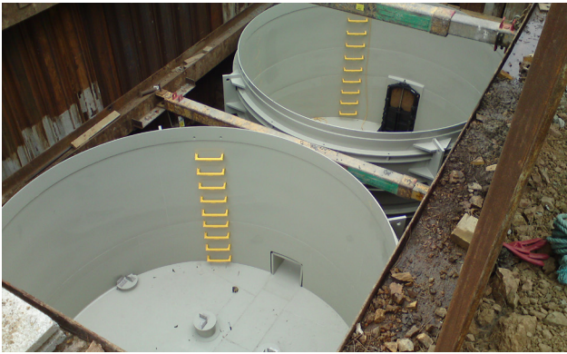
Large diameter holding tanks