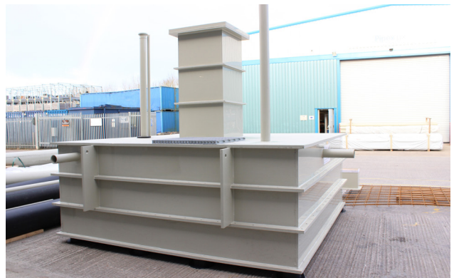
Rectangular holding tank