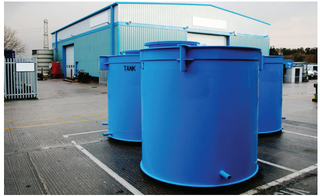
Polyethylene drinking water tank