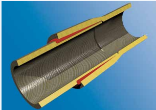
Quick-Lock™ adhesive-bonded joint