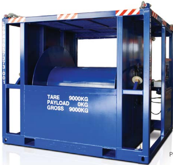
Part Number L-6941057373

The Reel Pack featured is designed to accept a one core Umbilical of 3.600m (11,811ft) in length with a minimum bend radius of 850mm.