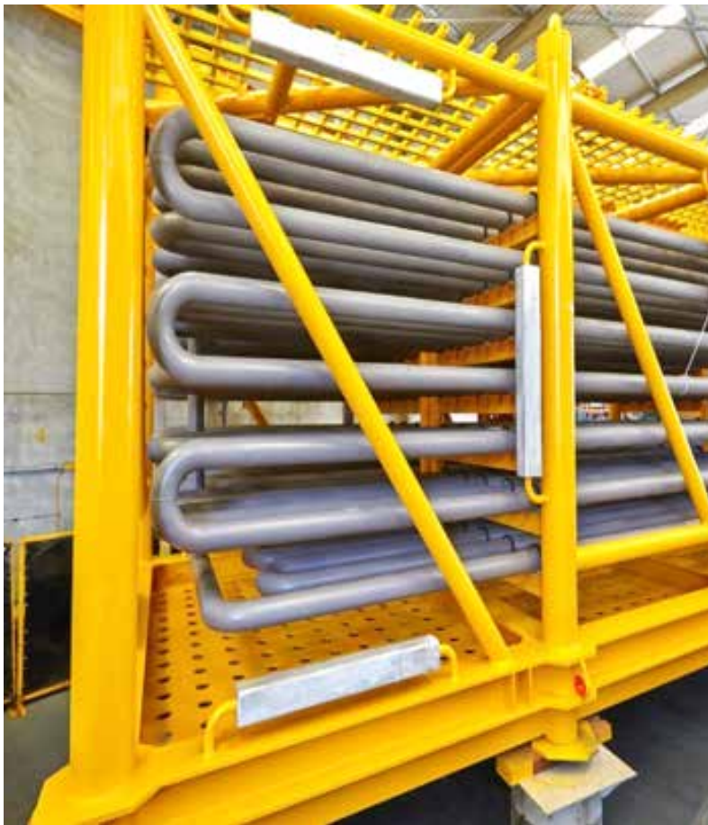
Subsea passiv cooler

Subsea Production Systems develops, produces and markets some of the strongest and most advanced subsea systems. Subsea Production Systems is a Business Unit in National Oilwell Varco (NYSE:NOV) which supplies customer-focused solutions that best meet the quality, productivity, and environmental requirements of the energy industry.