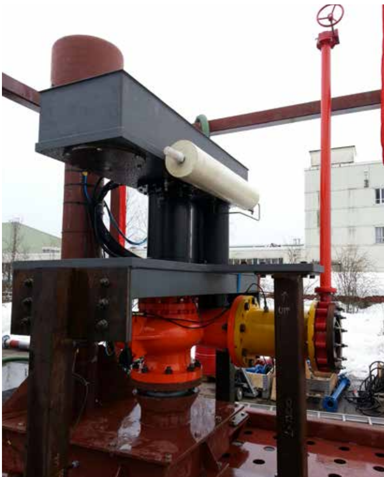
Subsea active cooler