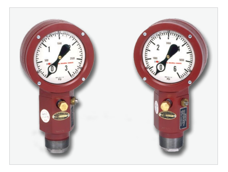
2" male NPT threaded connection and gauge case flats for easy mounting.

Designed for easy service on location with replaceable diaphragm cup and check valve for fluid loading.