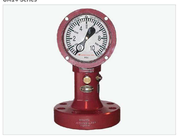
Available with optional API type 6BX 2 1/16" - 10 M flange for special applications.

NOV has the only mud pressure gauge that can be read easily from 75 feet and more away.