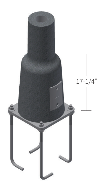
Elevation See Recommended "Capping Detail"