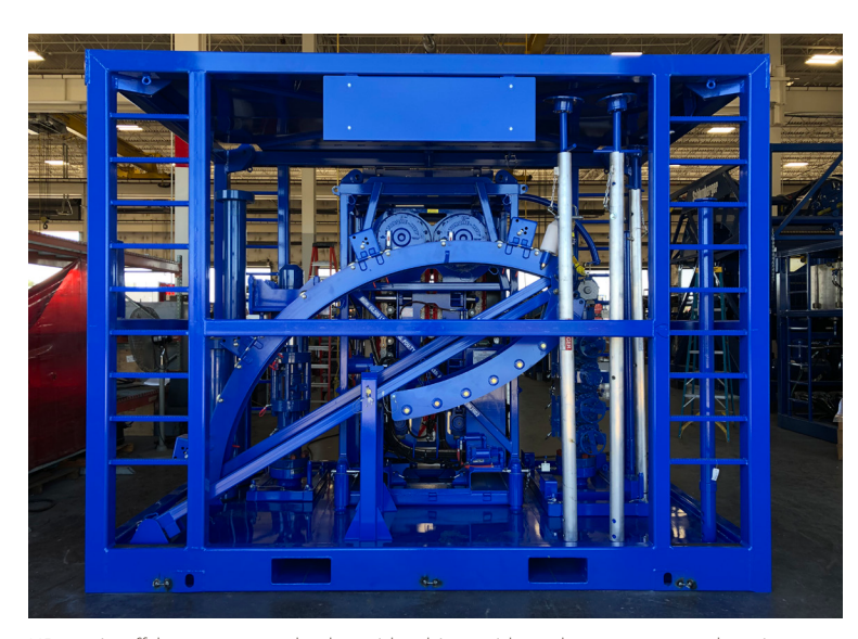
{\it HR-680}\ in\ offshroe\ transport\ basket\ with\ tubing\ guide\ and\ pressure\ control\ equipment