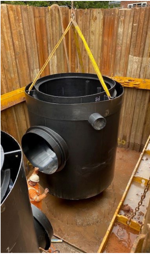
HDPE manhole installation supplied with optional shuttering to accept concrete poured surround.