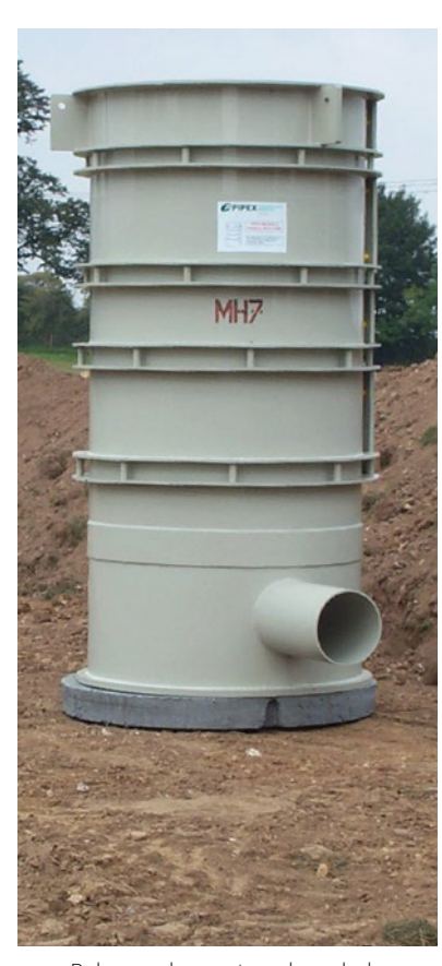
Polypropylene external manhole prior to site installation