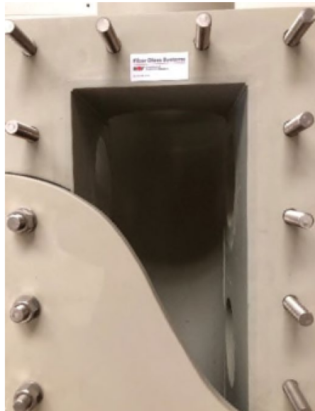
Bolted cover plates