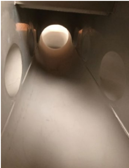
Smooth bore internal branch inlets