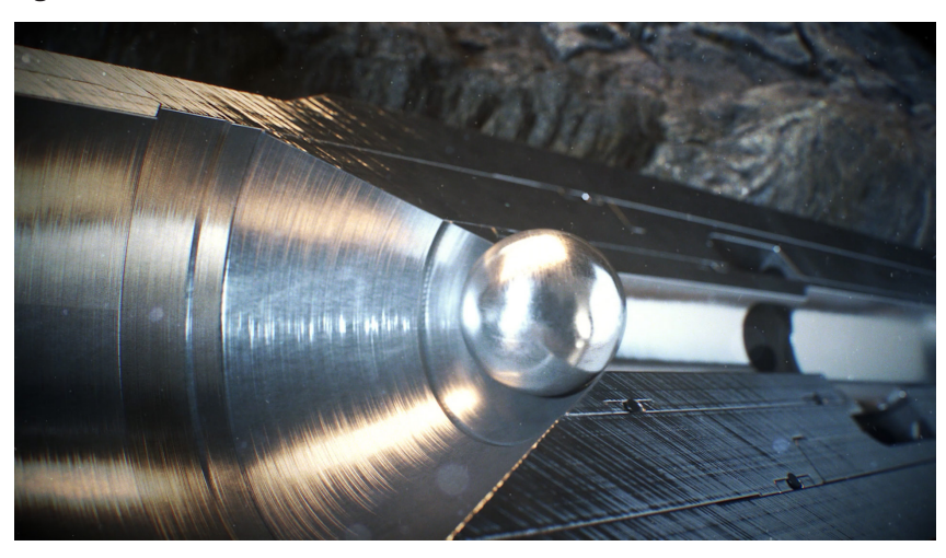
Figure 5. Flow Lock Sub.