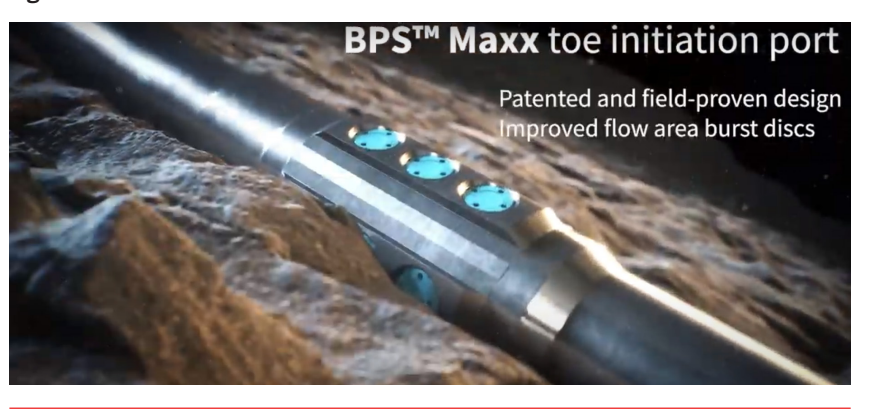
Figure 6. BPS Maxx.