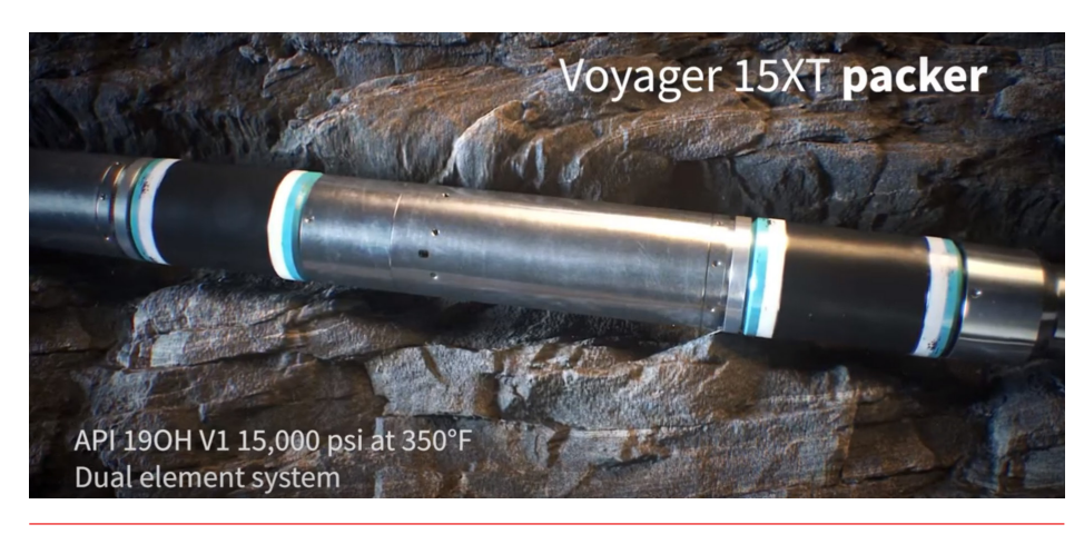
Figure 1. Voyager 15XT OH packer.

Tight HPHT reservoirs are anything but typical. Overcoming formation breakdown pressure in these cases requires a downhole completion that can deliver true 15 000 psi (1034 bar)