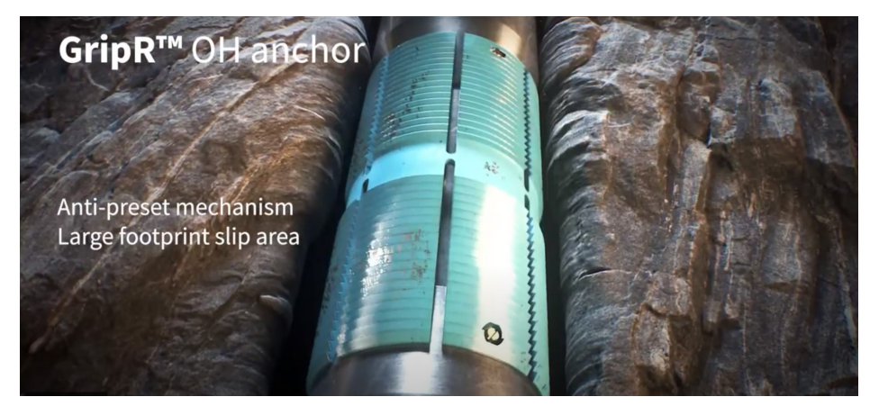
Figure 3. GripR OH anchor.

differential pressure, withstand stimulation pressures and is able to convey the fracturing fluid.