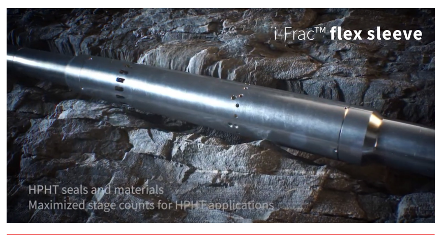
Figure 4. i-Frac flex sleeve.

Stimulation requires reliable frac sleeves. The i-Frac<sup>™</sup> flex sleeve (Figure 4) is a ball-drop-activated multi-stage fracturing sleeve for openhole or cemented completions. Multiple stages can be installed in a wellbore, with each stage containing between 1 to 20 sliding sleeves for optimised fracture design. This allows operational and stimulation flexibility for single- or multiple-point limited-entry openhole assemblies. For each stage, one ball is pumped from the surface to open all sleeves in