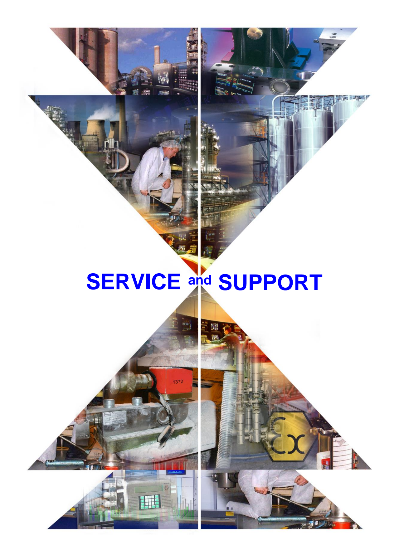
... Total Site Capability