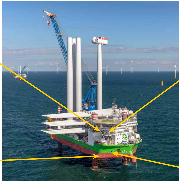
FRP Platforms and Stairs